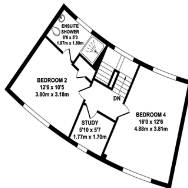
SECOND FLOOR APPROX. FLOOR AREA 473 SQ. FT. (43.93 SQ. M)

TOTAL APPROX. FLOOR AREA 1419 SQ.FT. (131.79 SQ.M.)