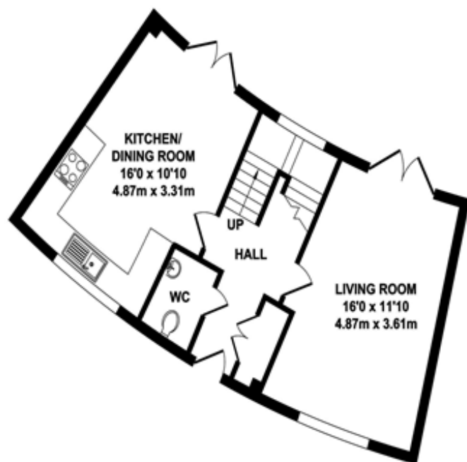
GROUND FLOOR APPROX. FLOOR AREA 473 SQ. FT. (43.93 SQ. M)