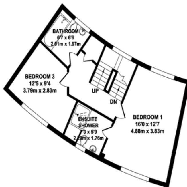
FIRST FLOOR APPROX. FLOOR AREA 473 SQ. FT. (43.93 SQ. M)